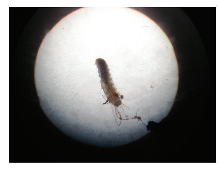
Figure 2 Photomicrograph of the cat flea larva (original magnification 10 \times ).

the culprit.<sup>1-3</sup> Unfortunately, preventative measures such as home fumigation and treatment of pets are costly and may seem excessive when families are sceptical of the diagnosis.<sup>3 4</sup>