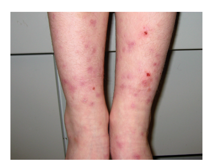
Figure 1 Clusters of excoriated erythematous papules and healing macules on the patient's lower extremities.

Management of papular urticaria – prevention and eradication – is usually implemented without confirmatory evidence of